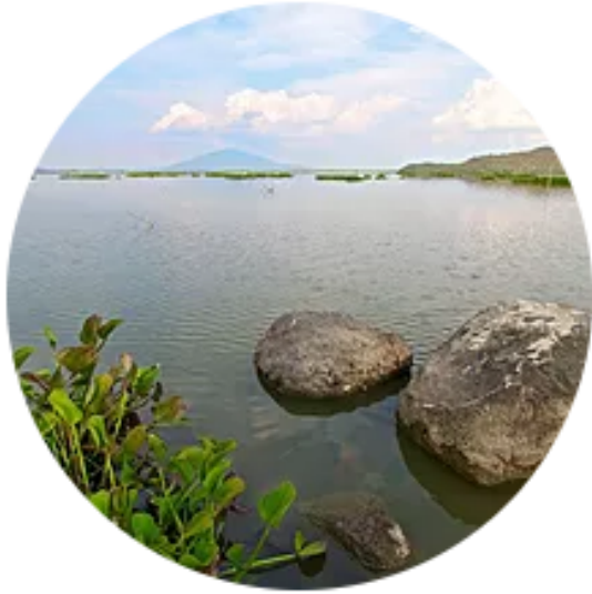
contest 1 Yuriria

3 different realities >>> 3 possible topics