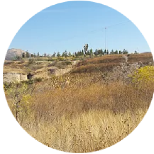
contest 2 Parque Bicentenario