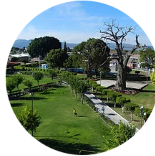
contest 3 Observatorio